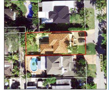
AERIAL PHOTOGRAPH (MAY NOT SHOW LATEST IMPROVEMENTS) (NOT-TO-SCALE)

BEARING REFERENCE: NONE. RECORD INFORMATION LACKS ANGULAR DATA. ALL ANGULAR DATA SHOWN BASED UPON FIELD OBSERVATION ONLY.